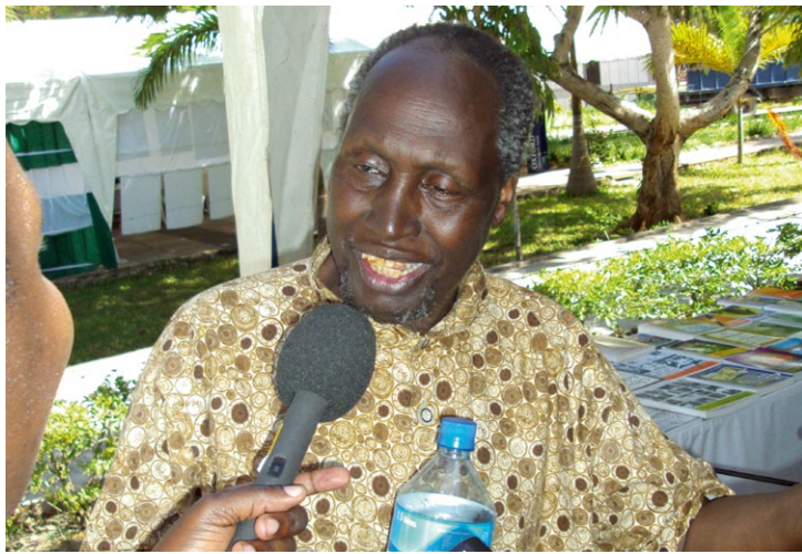
AVVA – Your gateway to the broad spectrum of creativity from the African continent.